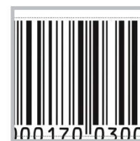
Examples of barcode proofing