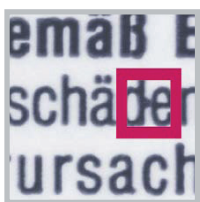
Examples of typographic flaws

The advanced pattern analysis of the EyeC Proofiler is able to distinguish between different types of defects so that deviations caused by the printing process itself, such as minor registration variations, can be accepted.