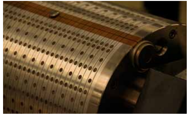
Hybrid drum for Flexo and Steel back Letterpress plates.