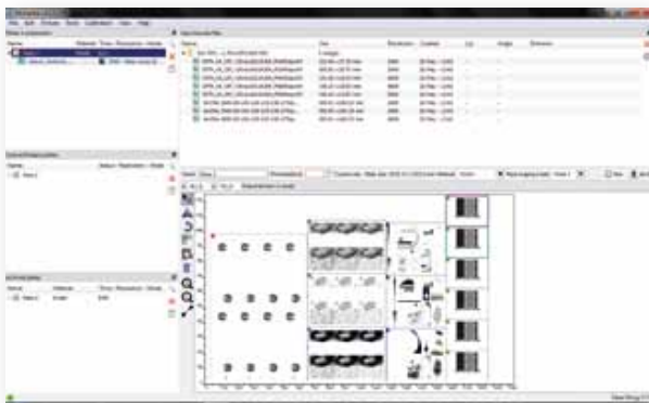
MultiPlate interface SW between Prepress and ThermoFlexX imager.

The fiber laser is today's best technology for digital imaging, offering superior quality. The robustly designed ThermoFlexX is made out of heavy duty industrial components, which makes high speeds possible without fluctuations and vibrations. This offers accurate and consistent imaging quality.